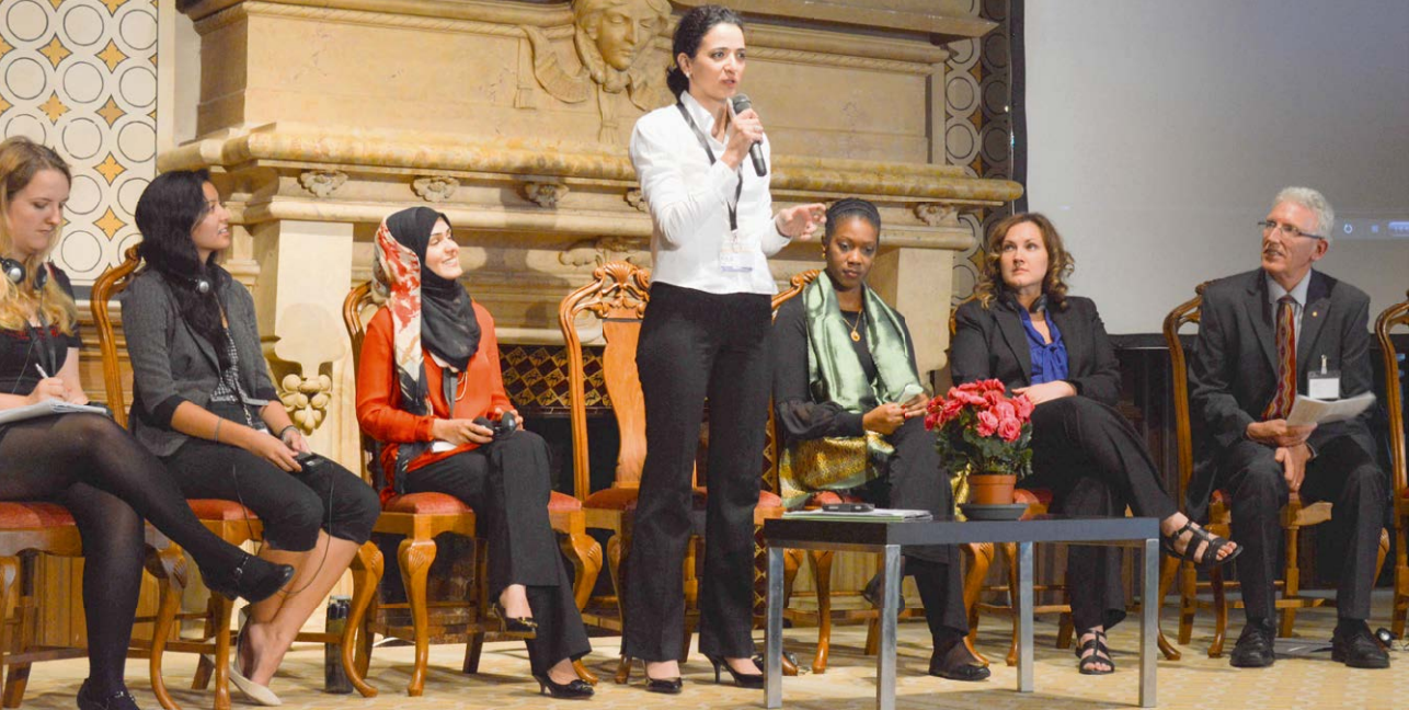
July 2014: Opening of Just Governance for Human Security Conference