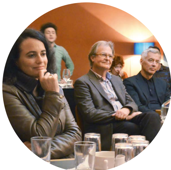
Information event in Basel with the GjakovaBasel Association.