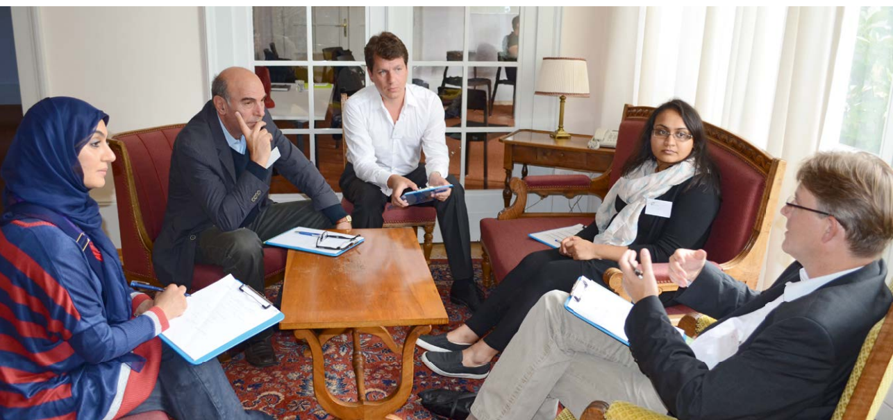
A discussion group at the Heart of Effective Leadership Training at the Villa Maria.