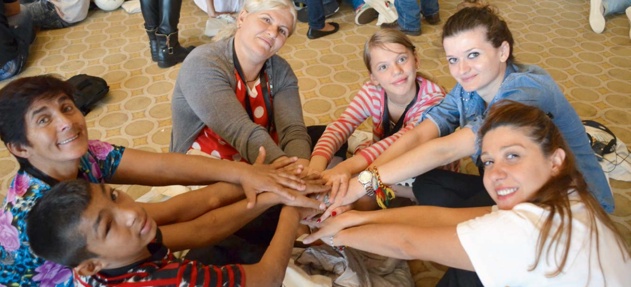
CATS Conference participants

Prevention and Recovery in Geneva. Participants included 28 civic and political leaders as well as government officials from Mali, Chad and Niger, sponsored by Switzerland's Federal Department of Foreign Affairs (FDFA) to participate in the conference and in a tailored workshop on 'dealing with the past'. Participants from the Ukraine and Russia, after heated discussions, agreed to create a Platform for Ukrainian-Russian Dialogue and Initiative that has been engaging Ukrainians and Russians since.