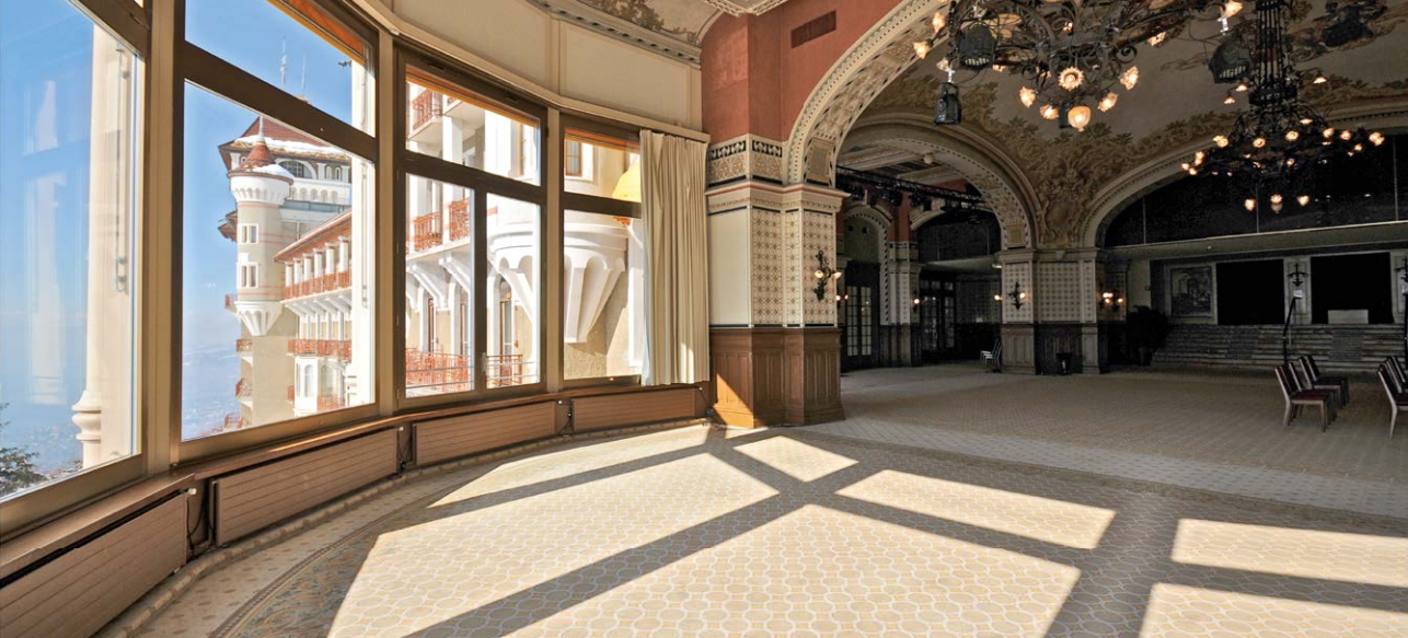
The Caux Conference Center's Main Hall overlooking Lake Geneva.